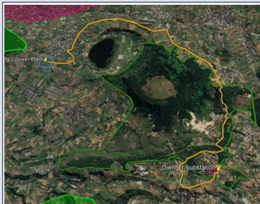
Figure 9.2: Location of Dieng geothermal expansion project in Java, Indonesia